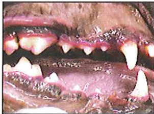
3 Weeks After Dental Cleaning

A professional dental cleaning by a veterinarian removes plaque and tartar on the teeth and below the gum line preparing the teeth for home dental care.