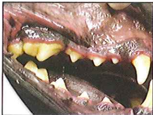
Before Dental Cleaning

Plaque and tartar are visibly present on the teeth. Untreated, plaque and tartar can develop into bad breath, tooth loss or worse. Professional dental care is needed.