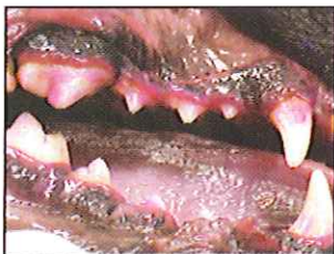
7 Weeks After Dental Cleaning

With the application of a disclosing solution, plaque can be seen forming on the teeth within only 3 weeks, without dental home care. Fortunately, daily home dental care can help prevent plaque buildup.