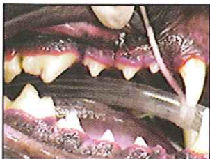
After Dental Cleaning

Plaque and tartar are visibly present on the teeth. Untreated, plaque and tartar can develop into bad breath, tooth loss or worse. Professional dental care is needed.